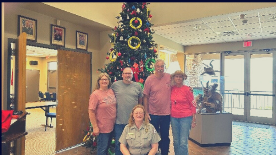
Photo: Walter F. George Reservoir with Water Safety Giveaway Tree

Quarter 4 | Jul. - Sept. | Submit by Sept. 25th